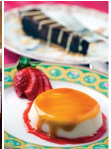
Key lime panna cotta and dark chocolate torte are two desserts offered at Six Tables.

($30) is a clean, crisp accompaniment to the menu.